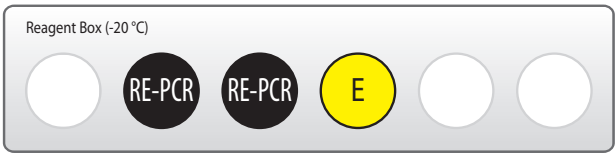
Figure 1. Location of kit components.